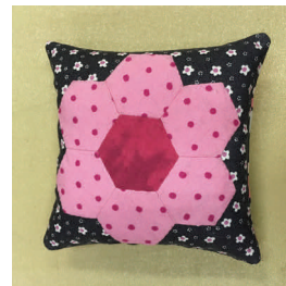
"English Paper Piecing" Pin Cushion Class at Olde World Quilt Shoppe