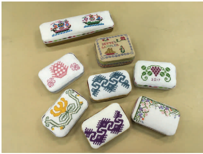
Bette Crowell's Stitched Tin Covers