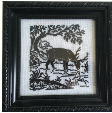
"Petit Cerf" by Dessins from Starlight Stitches Stash Sale