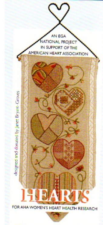
Photograph from March 2007 issue of EGA NEEDLEARTS magazine.

Hearts Bell pull, EGA's National Outreach Project for 2006. The EGA presidents over the past several terms have chosen the American Heart Association as the organization they wanted to sponsor. Heart designs have been created and sold by EGA with a portion of the proceeds benefitting the American Heart Association's women's heart health research. The books are $5.00 each plus $1 shipping (if we purchase more than 5 books). The project includes many different stitches, hardanger, pulled thread, blackwork and fancy stitches. We can discuss purchasing material and threads or sharing from our stashes among those who will be participating in the Project.