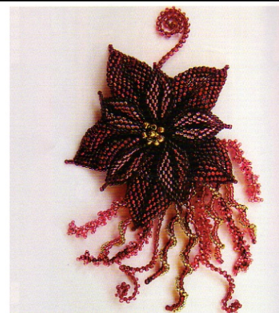
Holiday Brooch designed by Carolyn Sherman

Holiday Brooch is a beaded project located on pages 38-43 of the most recent EGA Needlearts magazine, Vol 40 Number 3, September 2009 issue. The only cost associated for this project would be the beads and misc. other materials to put the final piece together. The beads and other materials can be purchased and shared